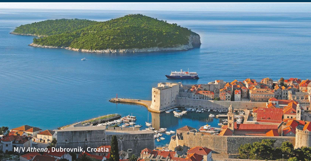
M/V Athena, Dubrovnik, Croatia