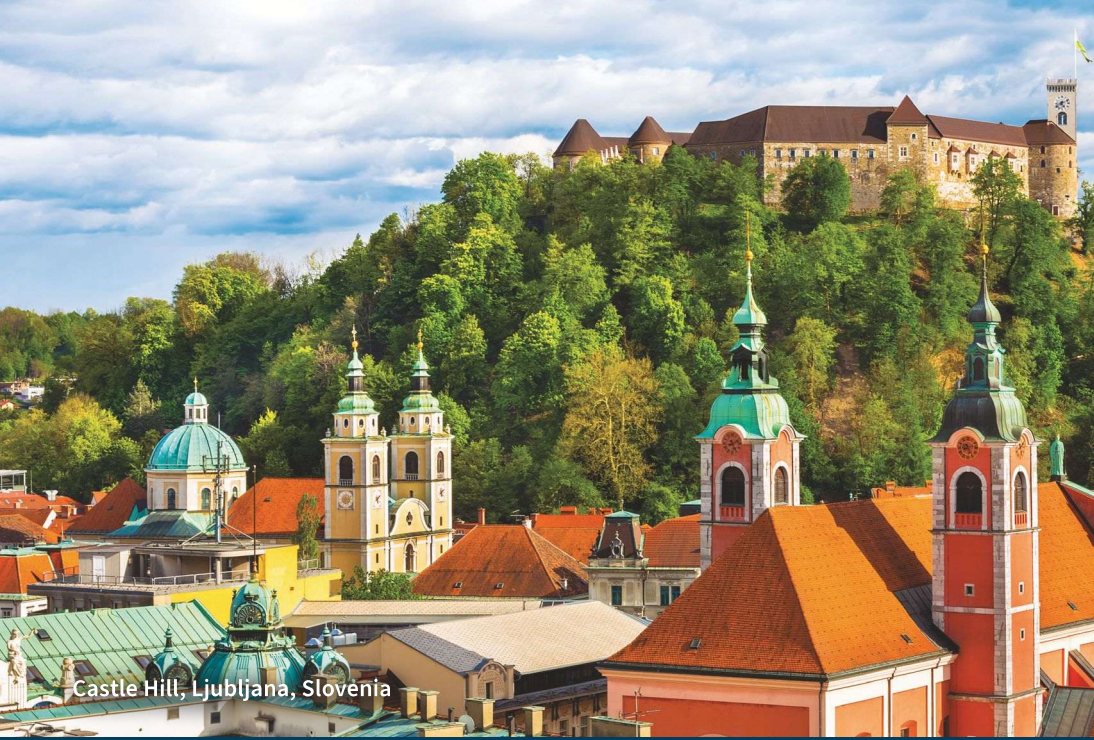
Castle Hill, Ljubljana, Slovenia